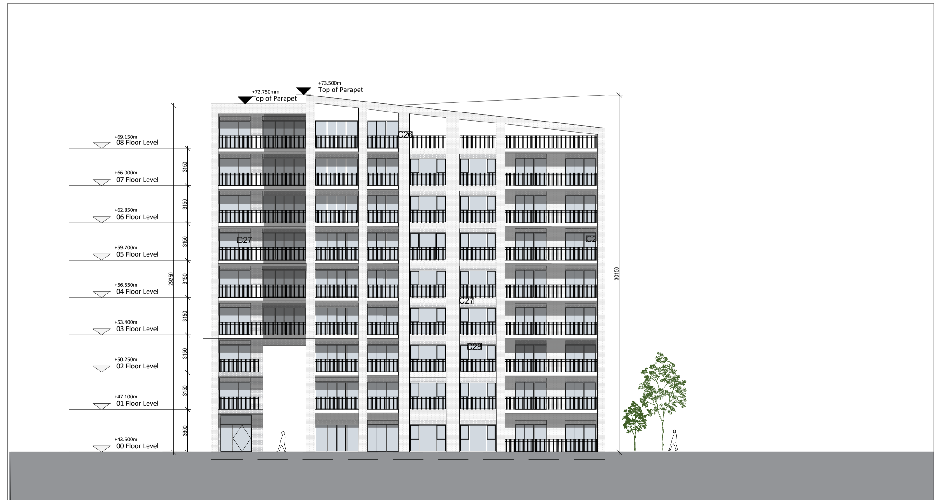
BLOCK 7 EAST ELEVATION (06)