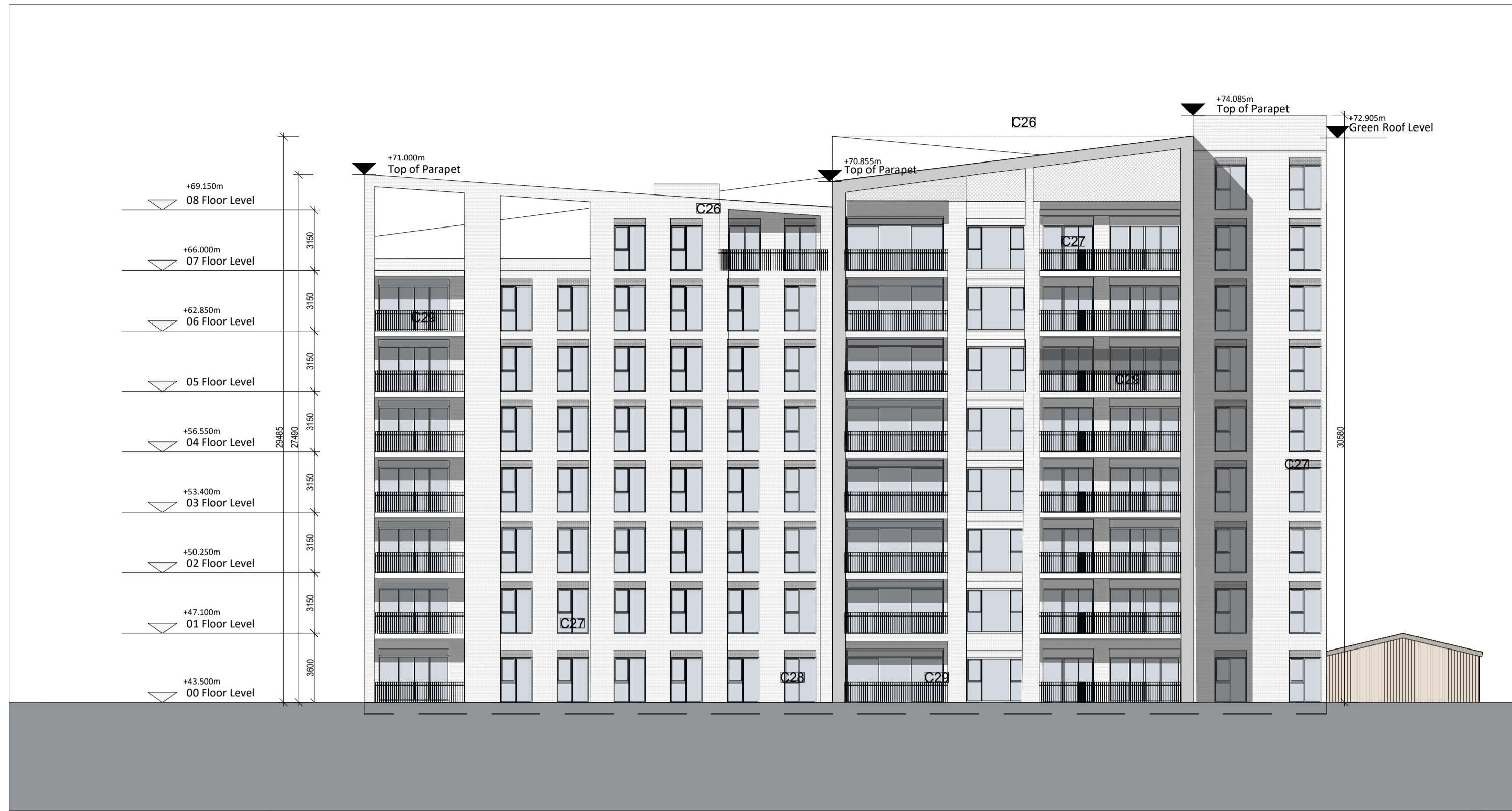
BLOCK 7 EAST ELEVATION (05)